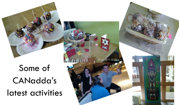
Some of CANadda's latest activities