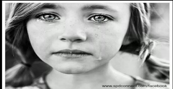
A meltdown is not the same as a tantrum. A meltdown means our sensory kids are having a hard time - not giving a hard time. They need our help & understanding.