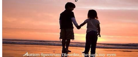
Autism Spectrum Disorder. Through my eyes

I thought I would have to teach my child about the world. It turns out I have to teach the world about my child.