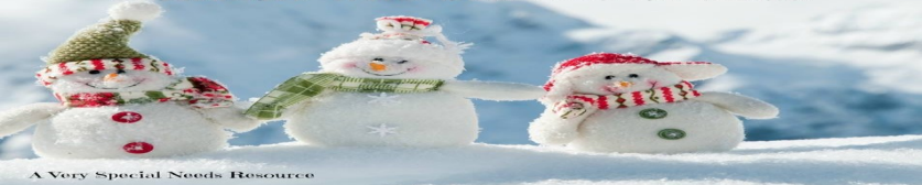
A Very Special Needs Resource

All children with Special Needs just need a little help, a little hope, and someone who believes in them