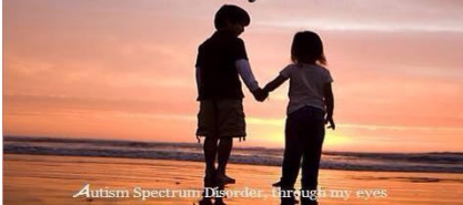
Autism Spectrum Disorder... through my eyes.

I thought I would have to teach my child about the world. It turns out I have to teach the world about my child.