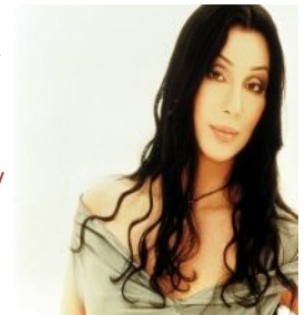
Cher - singer and actress.

She said in an interview: "I never read in school. I got really bad grades, D's and F's and C's in some classes, and A's and B's in other classes. In the second week of the 11th grade, I just quit. When I was in school, it was really difficult. Almost everything I learned, I had to learn by listening. My report cards always said that I was not living up to my potential."