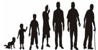
Autism Spectrum Disorder, through my eyes

Adults with Autism were once children with Autism. They too, need understanding, acceptance and awareness.