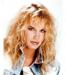
Daryl Hannah Actress

Despite first starring in films like "Splash," "Roxanne," "Wall Street" and "Steel Magnolias," she eventually had to settle for many straight to video projects.