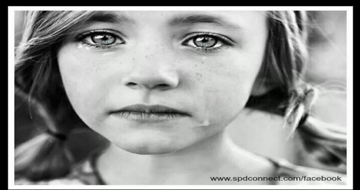
A meltdown is not the same as a tantrum. A meltdown means our sensory kids are having a hard time -not giving a hard time. They need our help & understanding